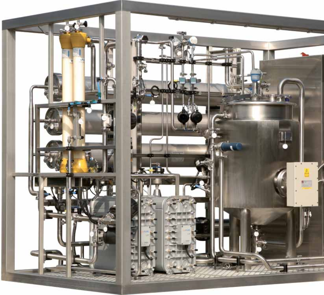
Softened water tank