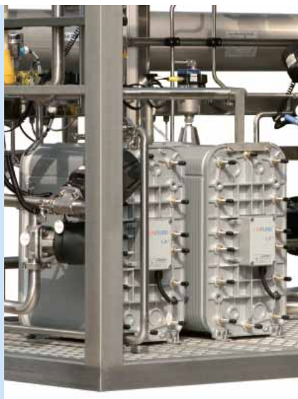
Continuous electro deionisation

The pure water exiting the CEDI passes to a UV unit or a 6,000 NMWL Ultrafilter to give added security in achieving the Purified and Highly Purified water specifications.